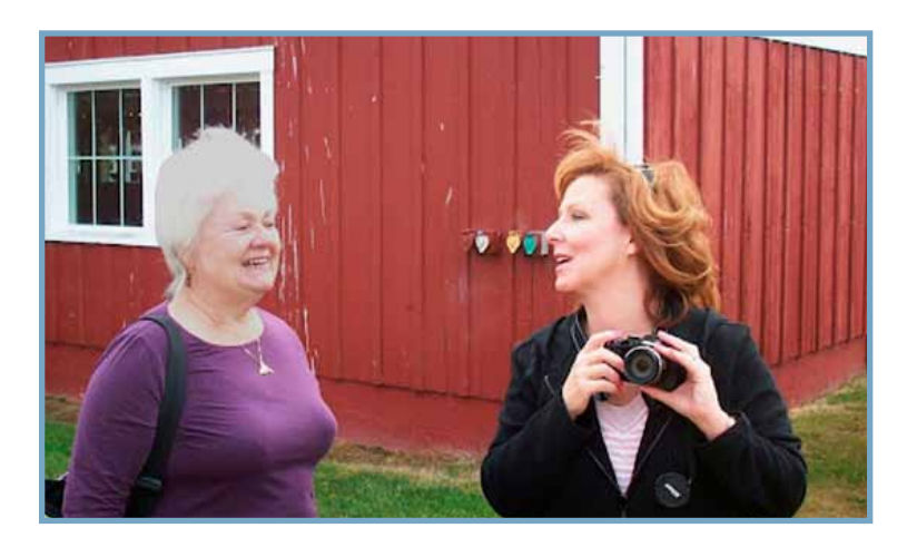
The two Nancys.