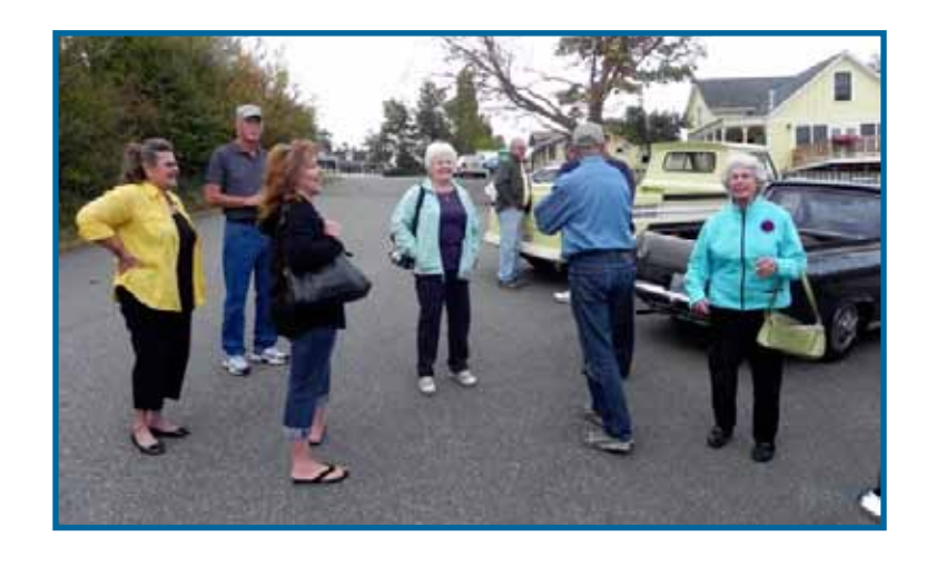
Everyone had a good time!