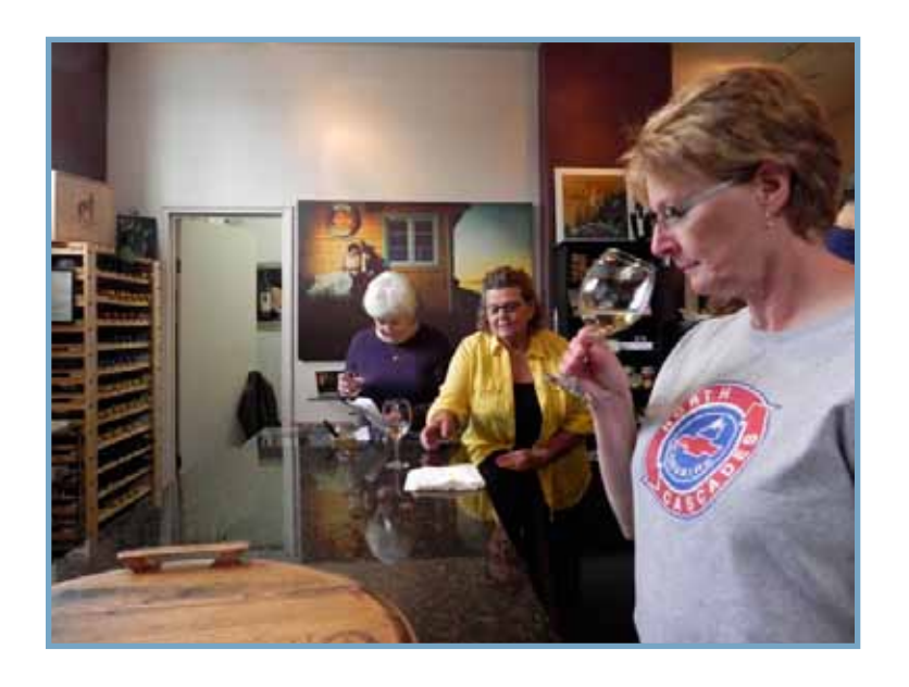
Serious wine tasting going on here.