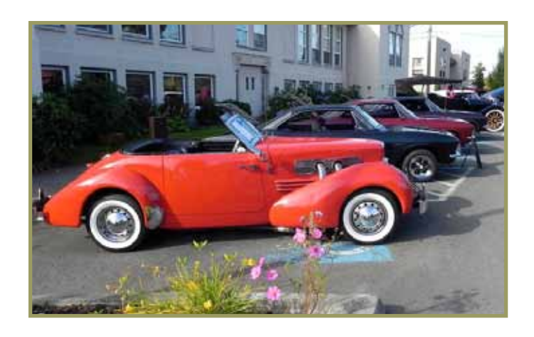
Andy's cord at the Stanwood show.