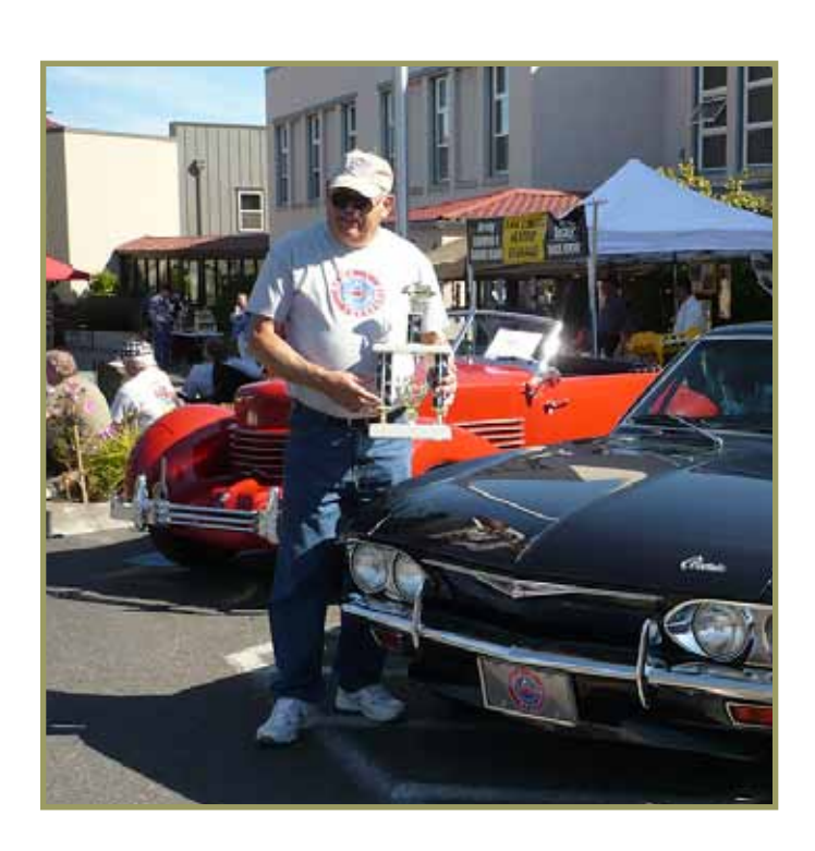
Fred C's car was judged 1st among all the 1960 thru 1969 models