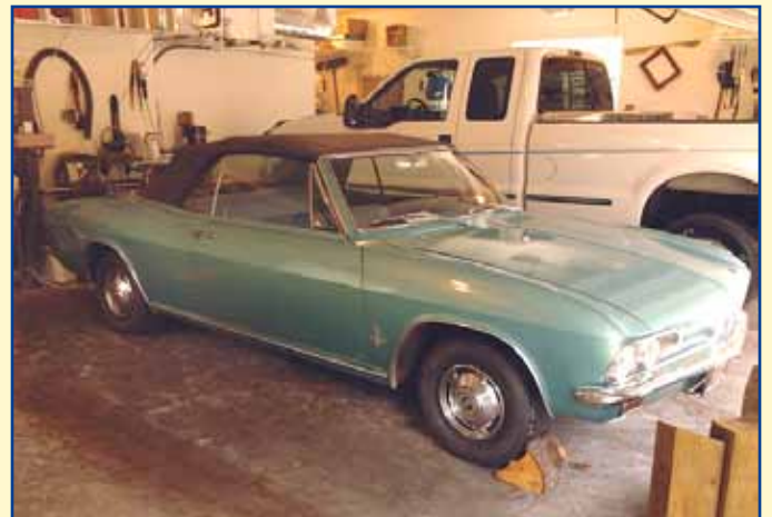
Dwain Wheeler's Car