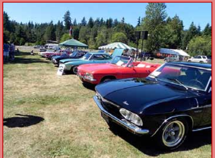
The Sunny Side Line Up at the Orphan Show in Bethel.