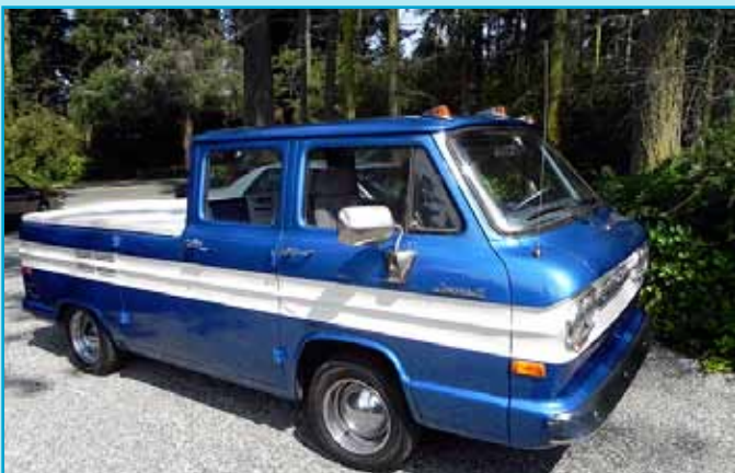
The Pfueller's Corvairant