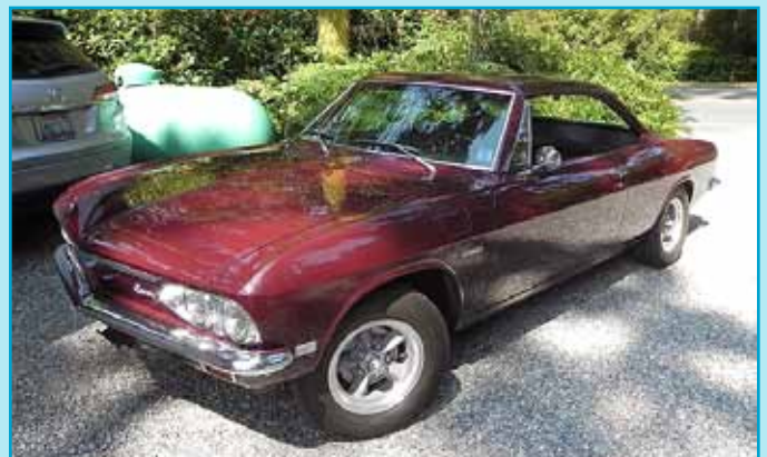
Nigel Gray's 1960 500. Beautiful.