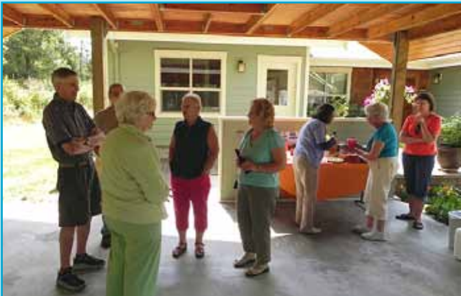
We gather by the food, naturally!