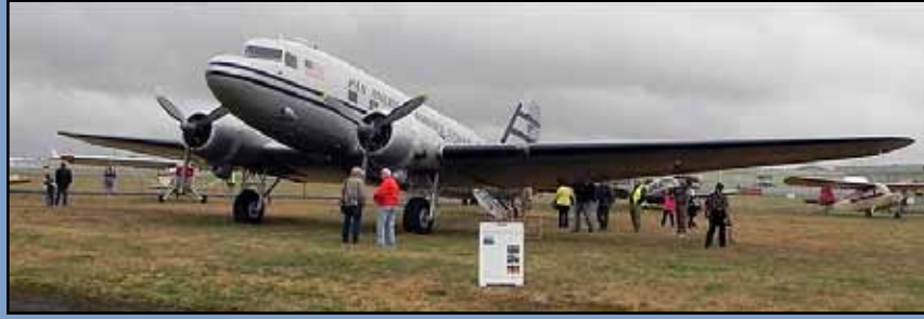
DC 3 Pan Am plane