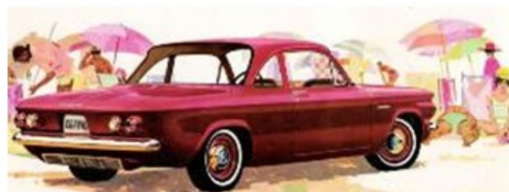
Chevrolet's 1962 Chevy Corvair came in a wide variety of body styles.