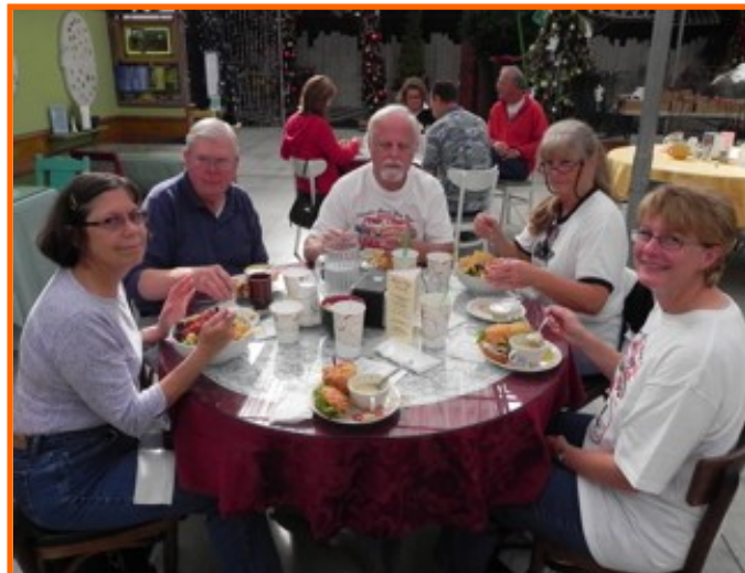
Lunch meeting for the Heritage Event