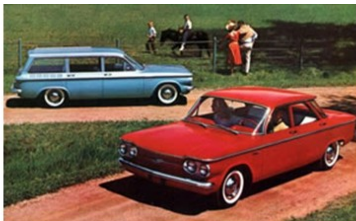
1961 Corvair Station Wagon and 4 door sedan