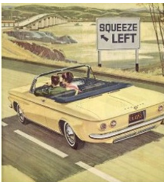
The Corvair was one of the least expensive Chevrolet's for 1964.