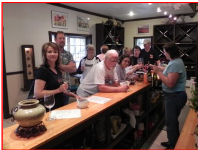
NCC Club Members Tasting Wine