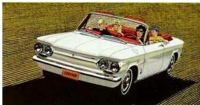
The 1963 Chevrolet Corvair Convertible