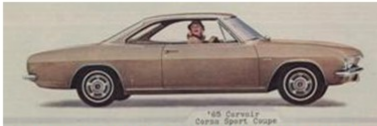
One of the most affordable Chevrolet's for 1965 was the Corvair.