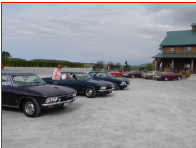
Line up display of Corvairs