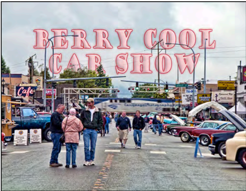
BERRY COOL SHOW JUNE 19, 2016 BURLINGTON

Twin City Idlers Show/Shine June 26, 2016 Stanwood