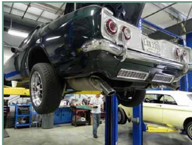
Old Exhaust while on the lift at Sunset Chevy

A couple of months ago I started doing research on mufflers that would be appropriate, and found several that had potential. At the recent tuneup at Sunset Chevy, the Corvair was up on the rack and it became clear that major work would have to be considered. The temporary fix to lift the muffler up did not work, as it had fallen during the drive home.