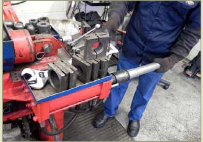
The Wizard resizing the tube on a hydraulic-mandrel to make proper fits on diameters. The end result is a proper adapter.