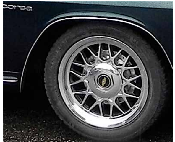
Whose wheel is this?