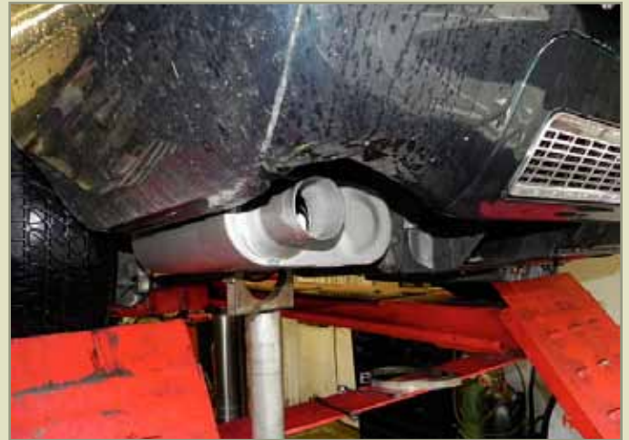
The new Flowmaster propped up for welding.