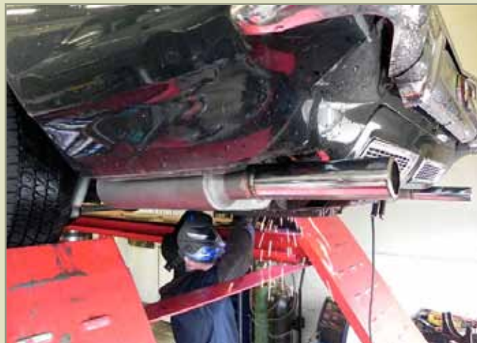
The new system completely installed with new extended tips.