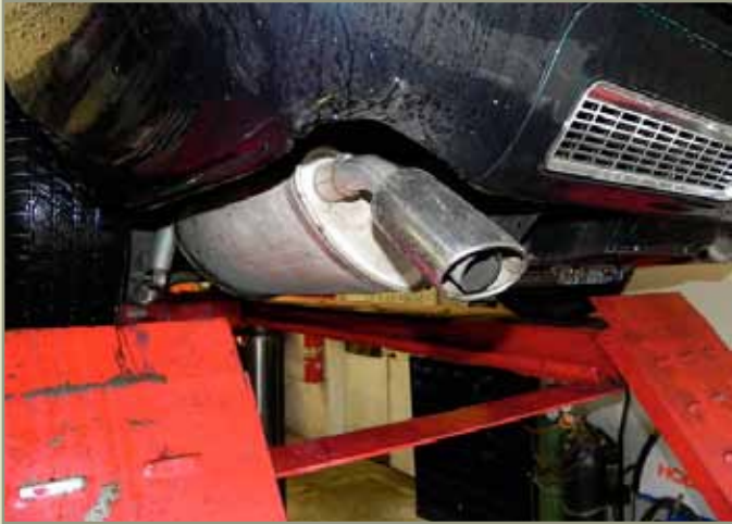
The old system as it was propped up