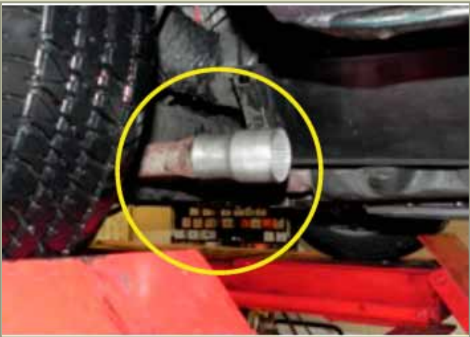
The end result is a proper adapter changing from the 1 3/4 inch of the "U" tube to the 2 1/2 inch inlet of the muffler.