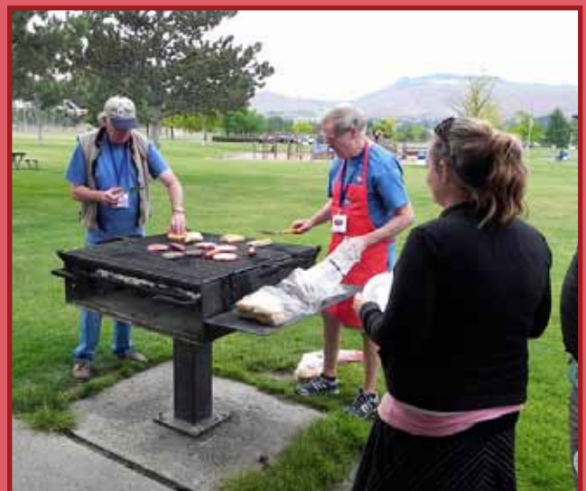
At the grill at the Wenatchee EconoRun

http://www.hagerty.com/classic-car-articles-resources/Features/More-Articles/Car-Profiles/All-articles/2013/11/12/Corvair-ownership?utm_source=ExactTarget&utm_medium=email&utm_term=&utm_content=&utm_campaign=Hagerty%20Weekly%20News%2011-20-2013 —Gale