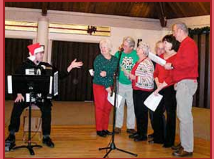
Caroling at the last Christmas Party